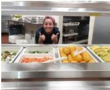
Daily fresh veggie bar!